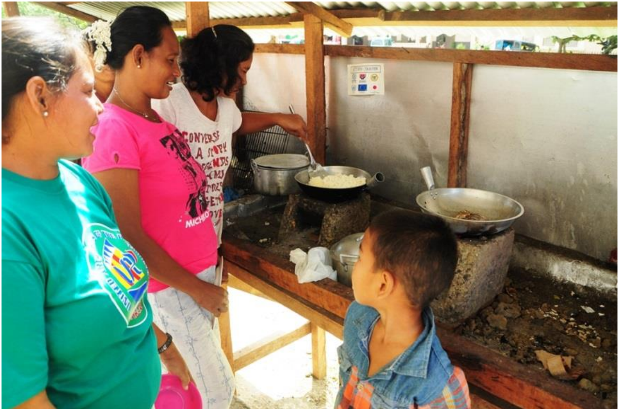
Kitchen counters provide IDPs a safe place where they can cook their food away from their temporary shelters. These facilities reduce the risk of fire hazards. It is also easier to cook food because they are of proper height or elevation. Photo taken at Zamboanga City East Central School (ZCECS).